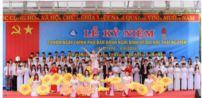
Art performance to welcome the anniversary