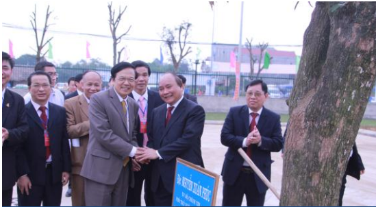
Mr. Nguyen Xuan Phuc, Deputy Prime Minister plants tree at TNU