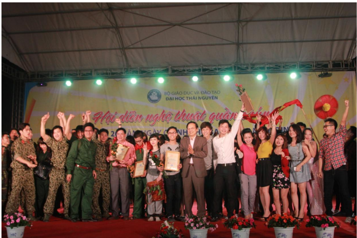
Music performance of TNU lecturers and students to welcome the special ceremony

So far, the organizational structure of the University was fundamentally shaped in a multidisciplinary and multi-level university model based on the research direction with 04 main blocks including advising, training, research, and for service and training – research support.