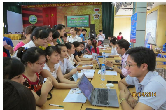
Employers interview TNU-CAF students

This was an opportunity for graduated students to find compatible jobs with their capacity and strength. The fair was also an important link between educational institution and agency using human resources, and between students and employers.