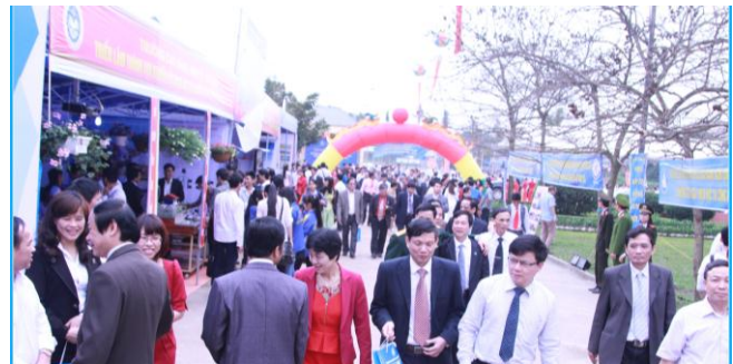
The Scientific and Technological Fair at TNU