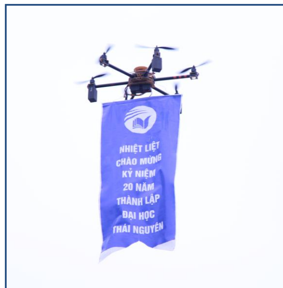
A special product of TNU students to congratulate the anniversary