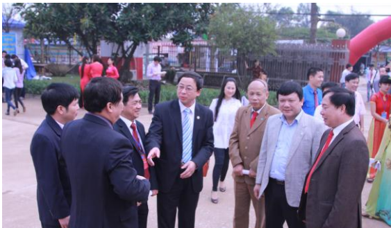
The anniversary is an opportunity for TNU alumni to meet up