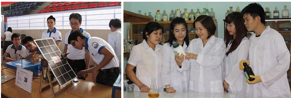
Some scientific and technological activities at Thai Nguyen University

provinces, etc.; “System of improving rice cultivation”(SRI) model applied on 400,000 hectares of rice in 08 provinces of the Northern midland and mountainous region with the participation of over 1 million farmers and was awarded “Golden Rice” award by the State; transfer of iron smelting line by arc furnace (without using coke) for Thai Nguyen Iron and Steel Joint Stock Corporation; System regulator speed for rewind machine at Bai Bang paper mill; System of automatic mine selection for Khanh Hoa coal mine (directly under Vietnam National Coal – Mineral Industries Holding Corporation); Manufacturing and supplying equipment of the tablet pressing for pharmaceutical companies Central 1, Central 2, Central 3 and many pharmaceutical companies all over Vietnam; Research on manufacturing flat knife for serving paper industry and wooden processing of wood enterprises at Phu Tho, Hai Duong, Hoa Binh, Nghe An, Quang Ninh, Hai Phong and Ha Noi from 1997 to now; system of Electrostatic precipitator system for cement and metallurgy plant, portal on scientific and technological information for Thai Nguyen and Bac Giang province, program of reproductive health care for women of ethnic minorities in the Northern mountainous area.