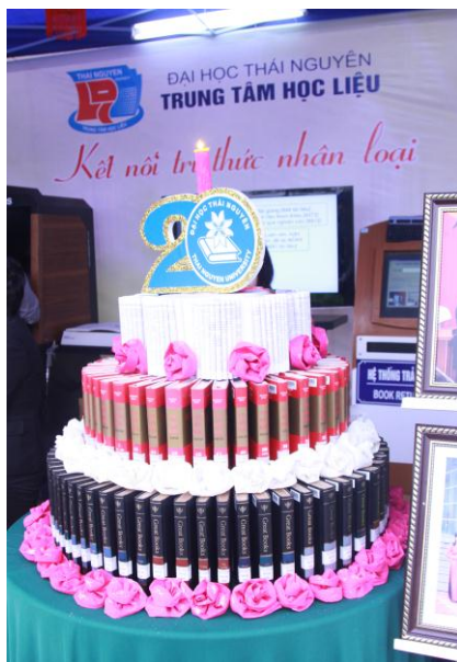
TNU "Birthday cake"