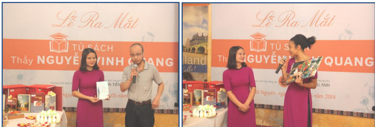
The foreign and Vietnamese lecturers present books for the bookcase