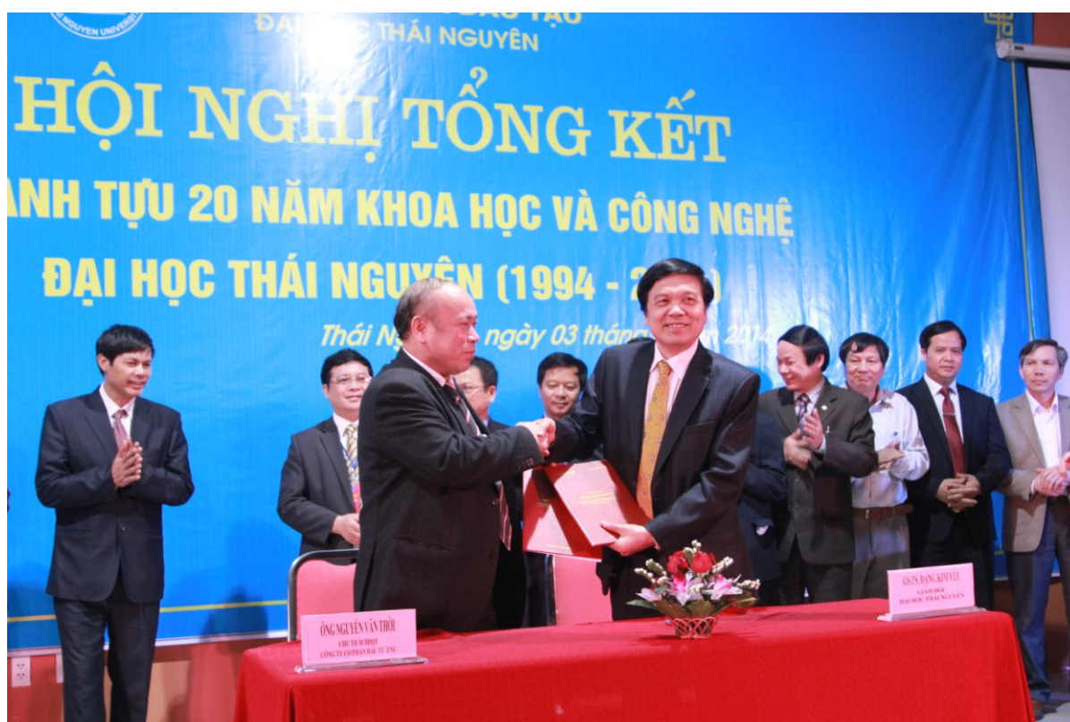
TNU signs MOUs with partners in science and technology research and application

Since its establishment, TNU has implemented 13,739 subjects and scientific projects at all levels, including 09 State level research projects, 8 Protocol research projects, 26 basic research projects, 1,450 Ministry-level subjects and scientific projects, 12,246 scientific projects at grassroots and student level, 5,009 scientific articles were published at domestic and international journals, science-technology books, including 733 international scientific journals. The university implemented more than 100 programs and collaborative scientific research and technology transfer projects with 13/16 provinces of the Northern mountainous region and 17 enterprises with total expenditure of more than 1,500 billion VND.