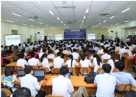
Panorama of the conference

On June 19, 2014, the TNU College of Information and Communication Technology (TNU-CICT) in collaboration with the Vietnam Academy of Science and technology of Vietnam, the Vietnam Union of Science and Technology, other universities and research institution organized the 7 th National Conference on "Fundamental and Applied Information Technology Research" - FAIR 2014.