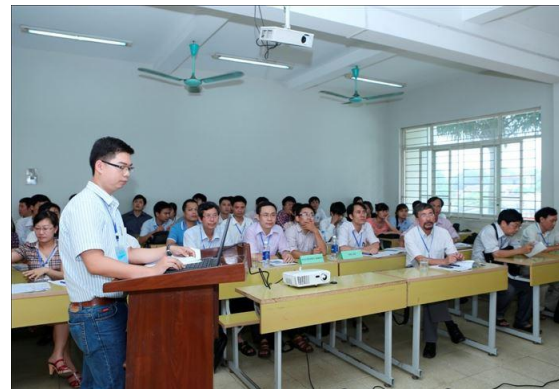
Report at a sub-committee

The conference had received more than 230 scientific reports, then 170 of them were chosen to present at the conference. This was the conference with the most quantity of reports. Those reports had updated and topical feature of basic research; creativity and urgency of applied research, such as device to measure power consumption using wireless sensor technology; Measures to protect information security for internal networks of internet-connected government agencies and businesses based on virtualization technology; Hedge Algebras Approach with intelligent decision support for disaster rescue, etc.