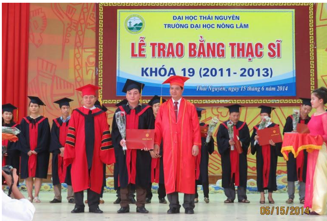
TNU-CAF leader confers degrees to the new masters