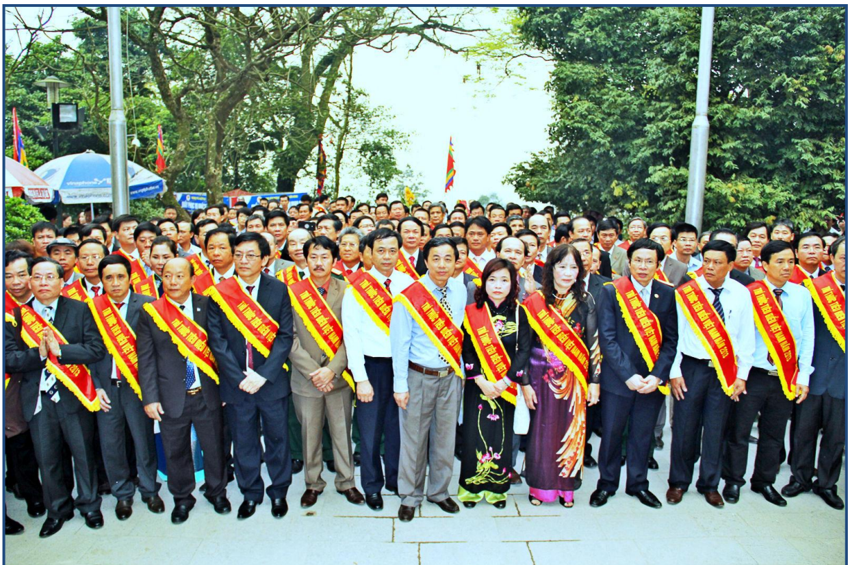
221 intellectuals report to the Hung Kings at Hung Temple Historical Site

The programs of voting Vietnamese representative intellectuals on the socio-economic front in 2013 attracted nearly 500 nomination profiles of notables and intellectuals throughout the country. After 04 months of deployment, the organizing committee selected 221 most excellent candidates to honor and award the Gold Prize in that occasion.